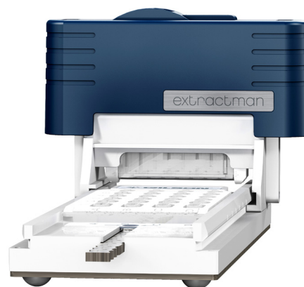
Figure 1 EXTRACTMAN ® enables rapid and gentle affinity purification of proteins, nucleic acids, and protein-target complexes.

One challenge is identification of native binding partners (target RNAs). De novo prediction of RBP binding partners is difficult. 2 RBPs may rely on sequence and/or structure for recognition of their target RNA molecules. RNA structures can be complex, with single- and double-stranded regions, gaps, and stem-loops. Isolation of native RBP protein-target complexes from live cells is an area of active study.